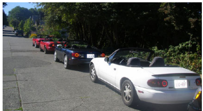
Pretty little Miatas all in a row.