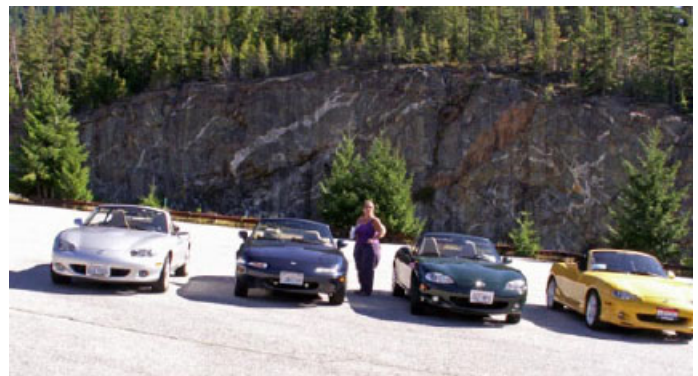
The scenery was breathtaking as it was, but add a Miata or two and then see what you get!