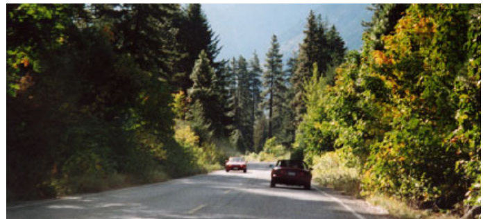
Zooming along the Backroads to Bavaria.

This ninth sort-of-annual Miata weekend in Leavenworth, sponsored by Club Miata Northwest, has evolved into a major stand-alone event which attracts Miata/MX-5 enthusiasts from all over the planet. On Friday, Oct. 6 th , we joined the CMNW west siders' tour from a dampish Monroe, gathering some Canadians and more PSMC Miatas on the way. Part way to Stevens Pass the sun came out (sort of) and some brave souls stopped to put their tops down. The foliage was turning on the west side, and as we gained altitude it changed more, and on the east side it was stunning.