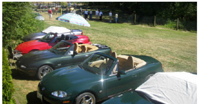
I've seen plenty of cockpit covers in my time, but this one has to be the most original!