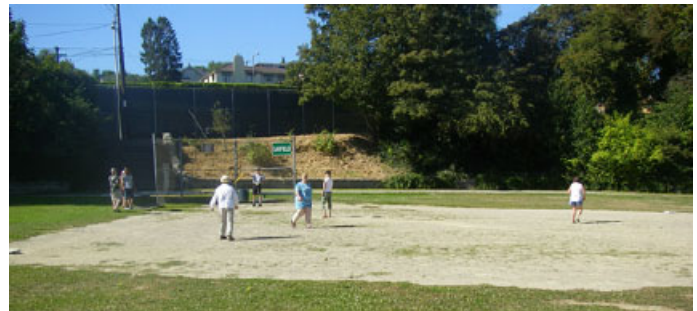
It wasn't just the Miata running around bases on this tour!