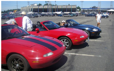
Getting ready to go run bases at Cheney Stadium.