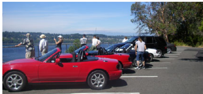
It wasn't all about running around the bases; there was even time to just sit back and enjoy the scenery.

We then all headed back to Cheney Stadium where most of the participants took in the Tacoma Rainiers/Las Vegas 51's game. Unfortunately, unlike last year when the Rainiers had a marvelous comeback, the home team lost 4-3. Oh well, there's always next year for the Rainiers, and for Run Around the Bases III – Three Strikes Yer Out.